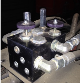
DBI-EZAIR-8500 $500 EACH