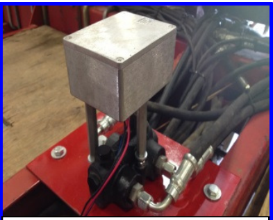
Actual valve mounting relocation bracket may differ from picture

PN: DBI-EZAIR-6000 $250 each, 1 required, $250 total